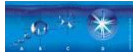
Formation, growth & Implosion of

The liquid, whether aqueous or solvent based, is a non elastic medium. The ultrasonic emitter sends a series of waves producing alternate high and low pressure areas. Where a low pressure state exists, the liquid shears and produces a microscopic vacuum bubble which grows over nanno-seconds. When the subsequent high pressure wave arrives, the bubble implodes releasing a substantial amount of energy.