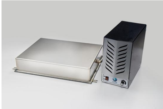
Generator & Immersible Set